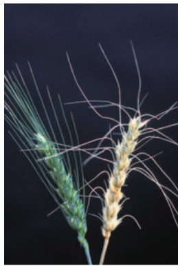
Healthy wheat head (left) Fusarium inoculated wheat head (right)

Organic farming systems reduce the prevalence of serious fungal infections, and hence mycotoxin risks, by promoting diversity in the microorganisms colonizing plant tissues and living in the soil; and by reducing the supply of nitrogen that is readily available to support plant – and pathogen – growth. Resiliency within diverse fungal and bacterial communities lessens but does not eliminate the risk that mycotoxin-producing fungi will become dominant. An excessive supply of nutrients almost always disrupts ecological communities in ways that favor certain fungi and can trigger or augment the production of mycotoxins.