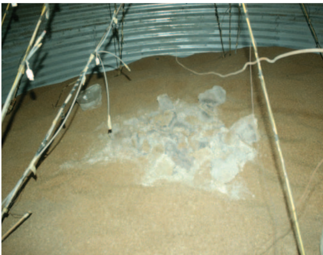
Surface mold on stored wheat.

Organic farmers focus on enriching the soil by building up soil organic matter and increasing the pool of nitrogen that is cycling through the soil. They use nitrogen-fixing legumes, cover crops, manure, compost, and relatively slow-release natural fertilizers to meet crop needs. In most crops, markedly lower levels of N are applied per acre on organic farms compared to nearby conventional farms. While this is a clear benefit in terms of mycotoxin formation