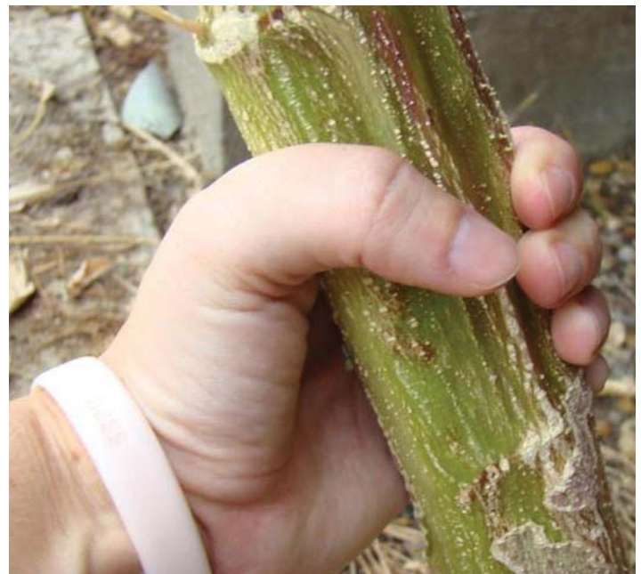
The stalk of a mature Palmer amaranth weed can reach six inches in diameter, and can damage mechanical cotton pickers.

The widespread adoption of glyphosate-resistant (GR), RR soybeans, corn, and cotton has vastly increased the use of glyphosate herbicide. Excessive reliance on glyphosate has spawned a growing epidemic of glyphosate-resistant weeds, just as overuse of antibiotics can trigger the proliferation of antibiotic-resistant bacteria.