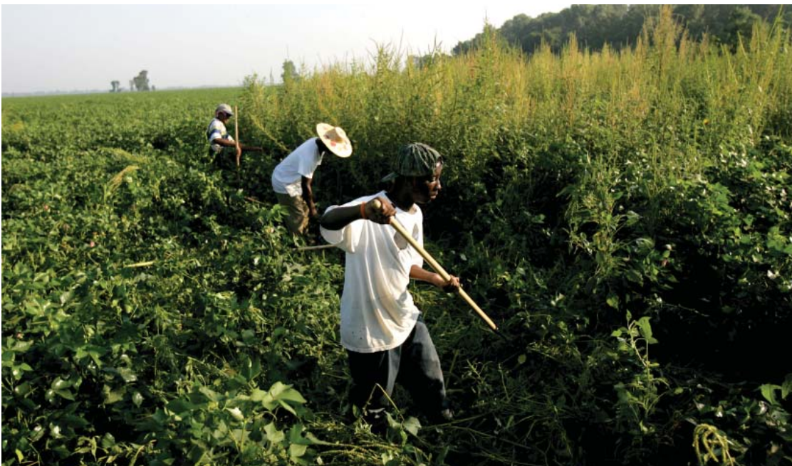
Farmers have resorted to hand weeding in an attempt to save cotton and soybean fields heavily infested with glyphosate-resistant Palmer amaranth.

Figure 1.1 shows the upward trend in the pounds of glyphosate applied per crop year 1 across the three HT crops. USDA NASS data show that since 1996, the glyphosate rate of application per