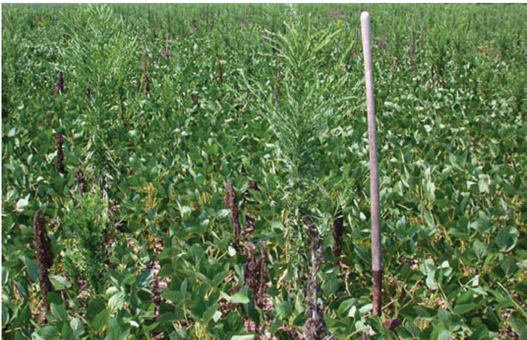
Heavy infestations of resistant weeds in cotton fields reduce crop yields and increase costs of production. Resistant populations of weeds can grow as tall, or taller than a hoe handle and produce several hundred thousand seeds per plant.

Bt cotton has now been grown for 14 years, but the acreage planted to it did not reach one-third of national cotton acres until 2000. Plus, the first populations of Bt resistant bollworms were discovered in Mississippi and Arkansas