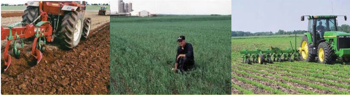
Farmers will have to diversify weed management tactics and systems to deal with HR weeds. Deep tillage (left photo) buries weed seeds; cover crops (center) can repress weed germination and growth; and mechanized cultivation between plant rows (right) is a proven alternative to herbicides.

cotton fields in 2003, about when experts predicted field resistance would emerge.