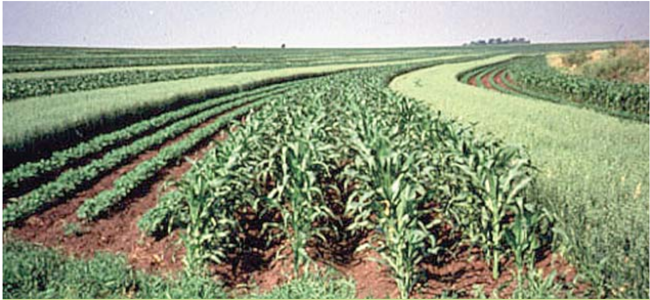
Corn and soybean strip-cropping systems reduce weed and insect pressure and lessen reliance on pesticides and GE crops